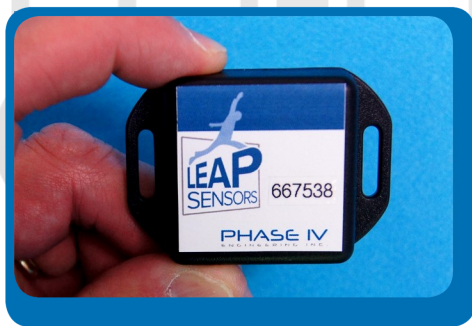
Leap Sensors—Rugged Miniature and Industrial

industrial | adaptable | feature-rich | high-reliability