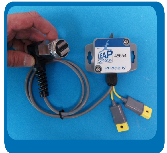
Multiple sensors per transmitter.

Sensor size, enclosure type, and antenna range can be designed to your specifications, including intrinsically safe (ATEX) enclosures.