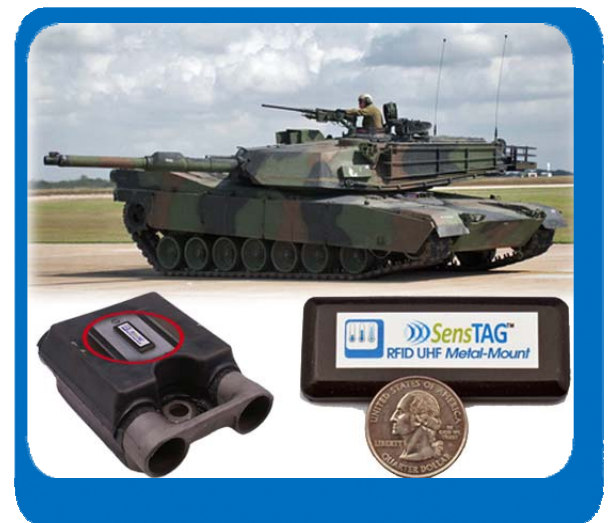
Metal Mounted SensTAGs were embedded in the rubber pads of tank tracks for temperature testing.

*We specialize in providing innovative sensing systems for hard-to-solve sensing problems. In addition, we offer a range of semi-custom products and complete turnkey manufacturing of custom sensing solutions for volume commitments.