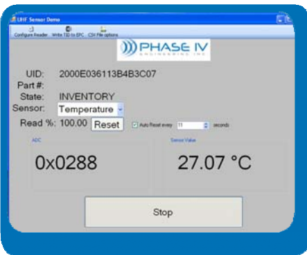
Software Interface for passive SensTAG RFID Temperature Sensor.

Contact Phase IV Engineering to explore how our innovative wireless sensing technology can work for your organization.